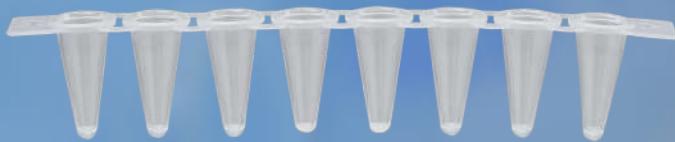
LOW PROFILE (0.1ML) STRIP TUBES