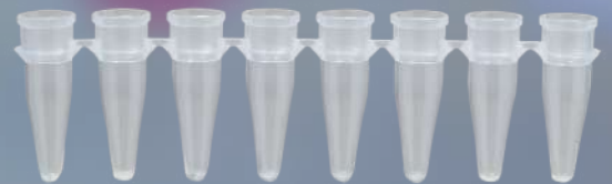
HIGH PROFILE (0.2ML) STRIP TUBES